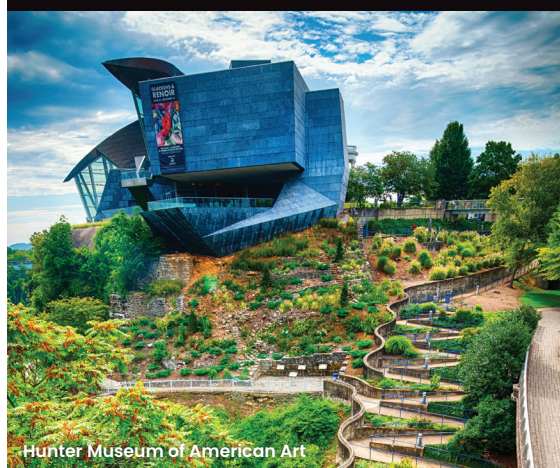
Hunter Museum of American Art